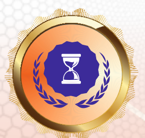
CA Woman Life Time Achievement Award

Recognising and Acknowledging exemplary contribution of CA Women Members